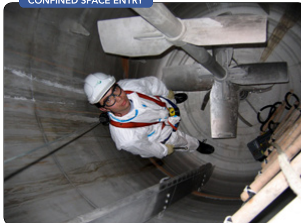
Figure 3. Manual cleaning in confined spaces raises safety, human error, and labor cost concerns.

method is unreliable, time-consuming, and requires excessive amounts of water.