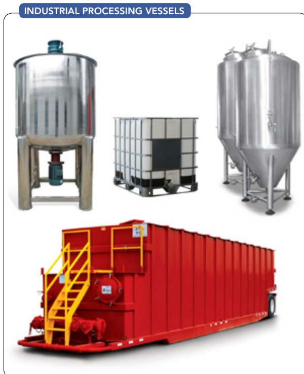
Figure 1. Modern cleaning equipment can safely and sustainably clean storage or process tanks, drums, blenders, reactors, kettles, mixers, shipping containers and more.

“We hear from companies daily that have had product recalls due to cross-contamination. Some