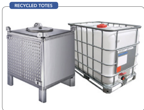
Figure 1. Totes and intermediate bulk containers such as these are used pervasively in processing applications and often need to be thoroughly cleaned for reuse.

The system exceeded all expectations and the trial was a resounding success. Gamajet systems utilize rotary impingement technology to create full-coverage, high-impact